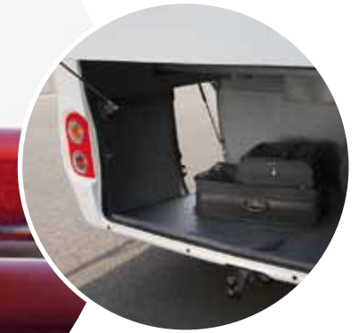
Ample luggage capacity