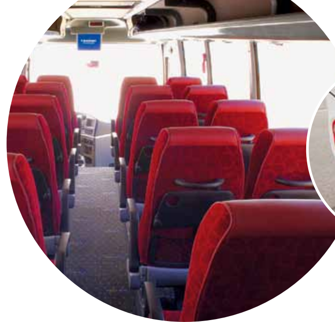
Overhead luggage racks

OPTIMISED COMFORT – The OPALIN's integral body structure reduces the effects of vibration and sound, contributing to the vehicle's already high comfort levels.