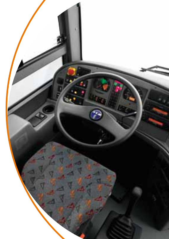
Comfortable driver's area