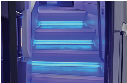
Refined entrance with indirect lighting and spacious steps