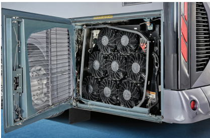
Electric fan: reliable, fuel-efficient, easy to maintain