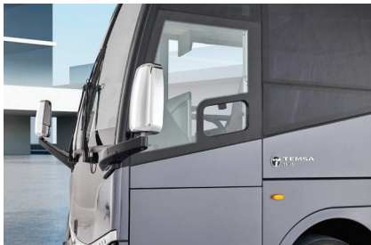
Rewamped driver window, clear visibility and sleek look