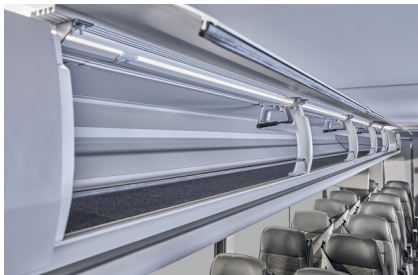
Enclosed parcel rack doors: reliable, spacious, polished