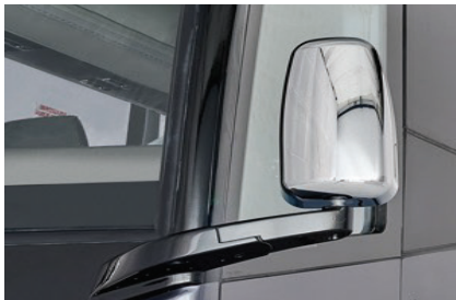
Bold new mirror arm design: stylish, and striking