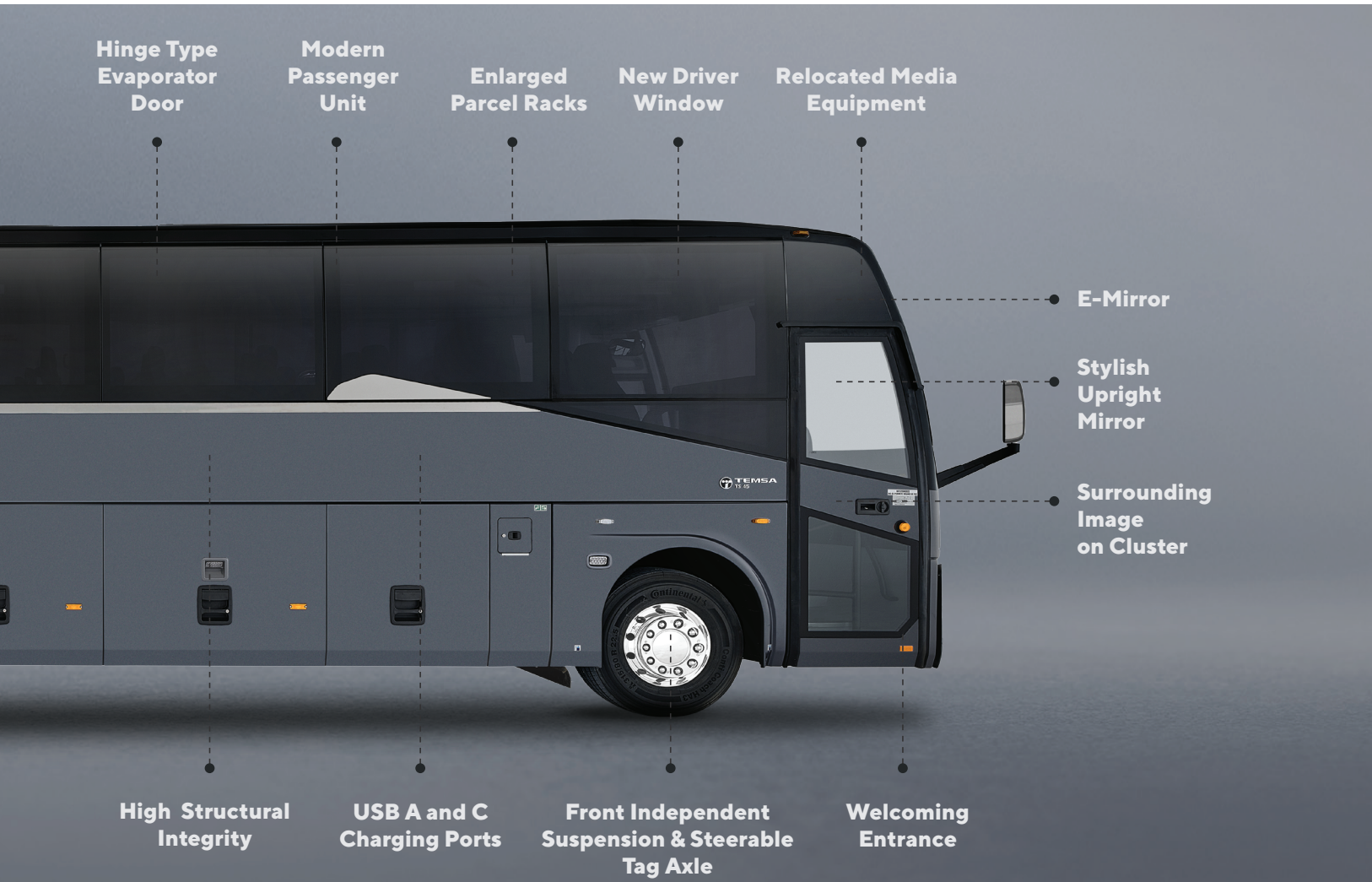
Hinge Type Evaporator Door