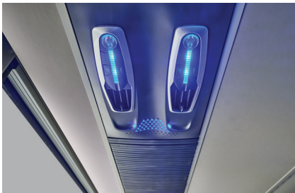
New passenger units, with modern & futuristic design