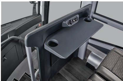
New modesty panels with elegance and functionality