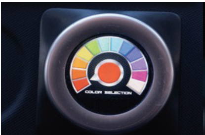
Customizable ambiance with the RGB lighting