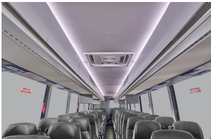
Enlarged parcel racks with indirect lighting & elegance