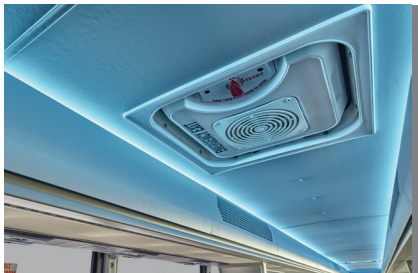
Industry standard hatch with added ventilation