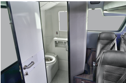
New restroom: spacious, ergonomic, bright, classy